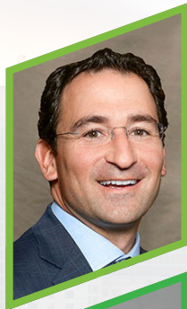
Jonathan Gray Global Head of Real Estate and Member of the Board of Directors, Blackstone Group