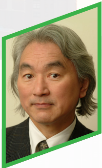
Dr. Michio Kaku Theoretical Physicist, Professor, Author and Futurist Presented by Prologis, Inc.